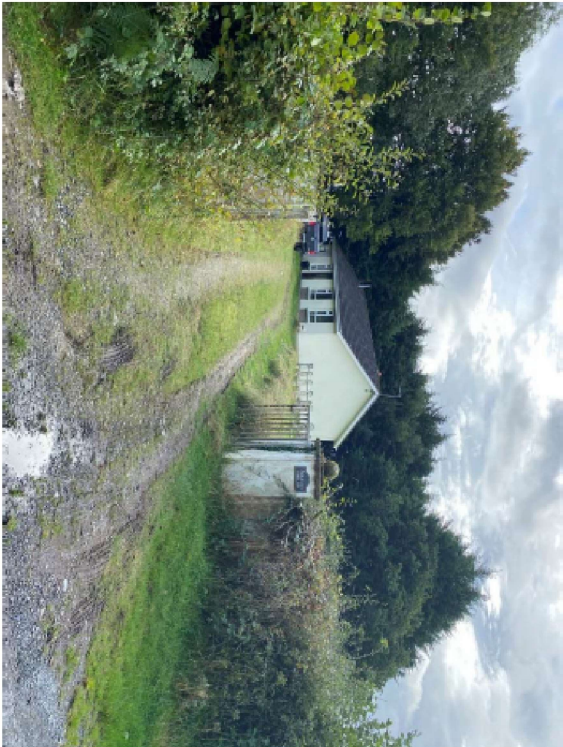
ORG ENTRANCE GATE – ONE OF THE CONCRETE PIERS REMOVED TO GAIN ACCESS